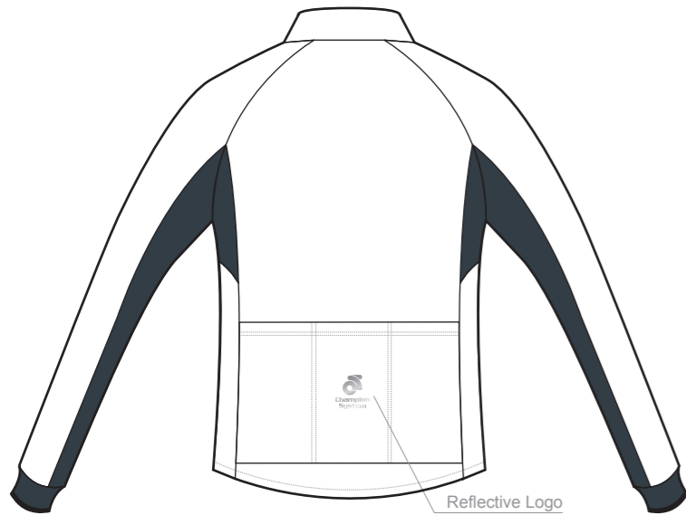
: CS APEX Winter Shield PRO Jacket : MWJ026