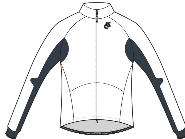
: CS Apex Winter Shield Fleece Jacket : MTF052