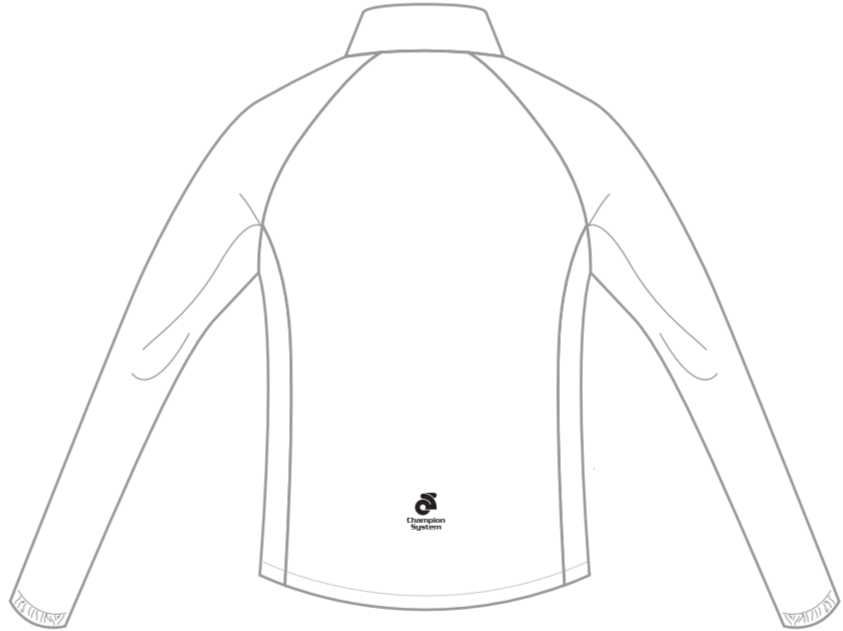
: BACK VIEW :