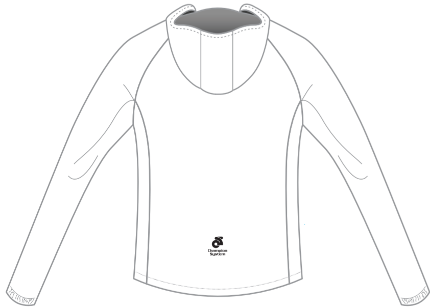
: BACK VIEW :