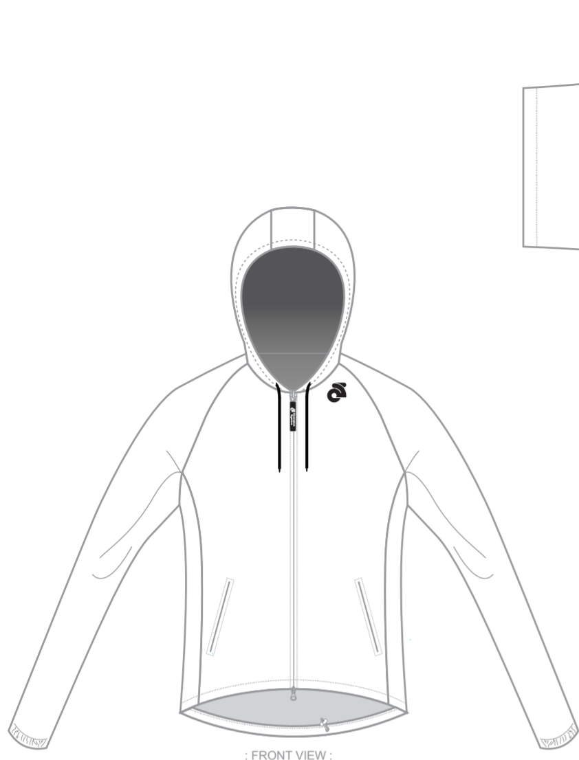
: FRONT VIEW :