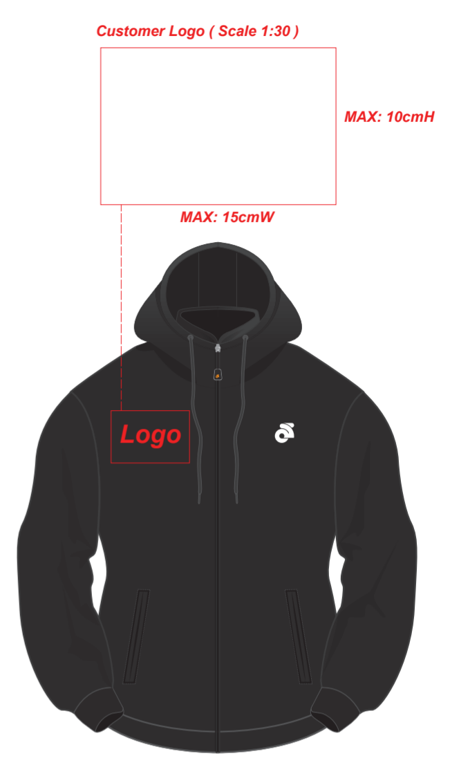
: FRONT VIEW :