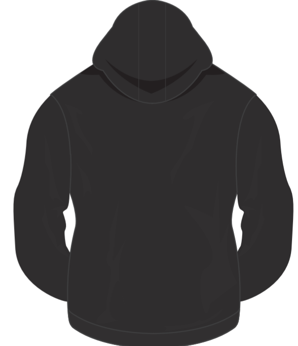
: BACK VIEW :